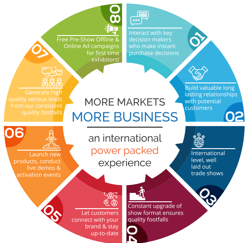
Exhibit your business to the burgeoning Dental industry